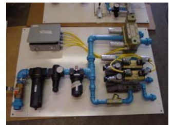
Pass line entry/exit air wipes