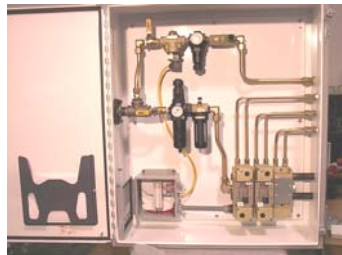
LMF Slide Gate Valve Panel