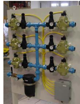
Entry & Exit Air Wipes