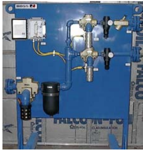
Pickle Line Scale breaker Air Blow off Panel