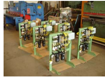
Cold Mill Wiper Roll Control