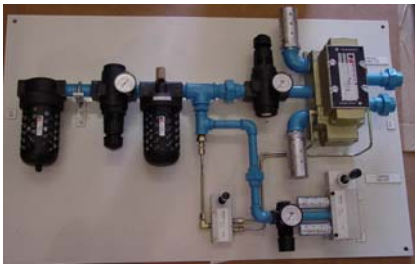
Cold Mill, Work Roll Change Tug Valve Panel