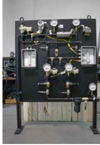
Furnace Argon/Nitrogen Panels