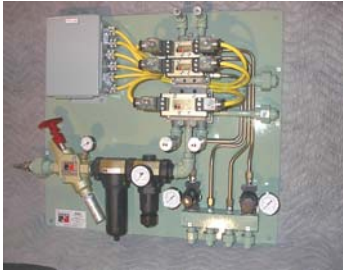
Plate Thickness Measuring Panel