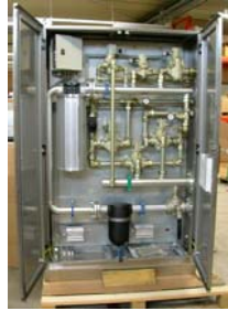
Blast Furnace Tap Hole Drill Control Panels