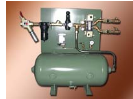
EAF Tap Gate Control