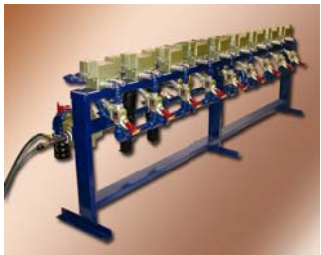
Galvanizing Line Roll Controls