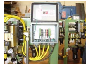
Typical Wiring Arrangement