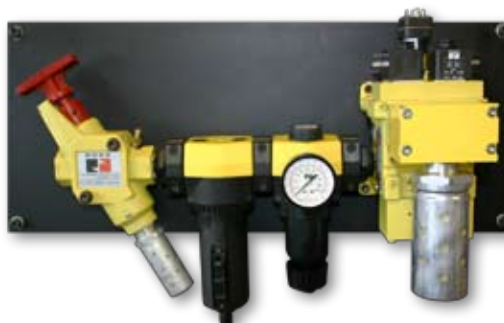
Air Entry Package with Control Reliable Energy Isolation

Some ways to improve uptime for production-related activities include positioning the lockout devices in locations that prevent unnecessary commuting time between the lockout location and the work that is to be done. This locational lockout presents a great advantage with alternative solutions that offer multiple low-voltage lockout locations. This remote low-voltage lockout system is discussed in Annex G of the ANSI Z244.1-2003. “This technology uses a dedicated system of lockable dual-channel low-voltage safety switches located at multiple locations around a production machine to activate a lockout.” By positioning these devices at multiple locations, there can be lockout locations at all typical access points as determined in the risk assessment.