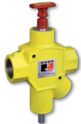
L-O-X® Valve Pneumatic Energy Isolation for LOTO

What are the costs of lockout on production? The simple answer is that the machine and process are not running while lockout is occurring. The total time from when the machine is shut down until the machine is re-started is lost opportunity from production. Looking at this downtime and the dollar rate of production from the plant, one can determine the cost of the lockout. There is typically the upstream and downstream equipment to consider and the effect a shutdown would have on them. The processing material, of course, becomes of primary concern, as well as preventing the creation of unsalable product. Preventing production while producing scrap exasperates the costs involved. It is these potential total costs that must be used in evaluating the true cost of a lockout event. Any time savings that can occur by using alternative measures and machine guarding for minor servicing activities can provide a clear, measurable payback based on the production values.